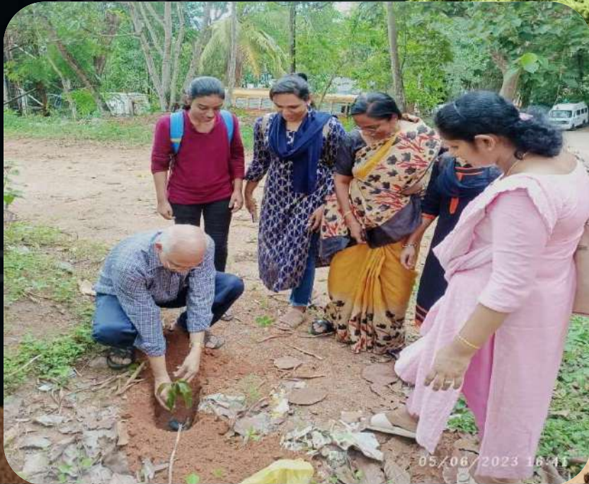
Green / Clean Campus : A Sustainable Tree Planting Initiative around Our Institution